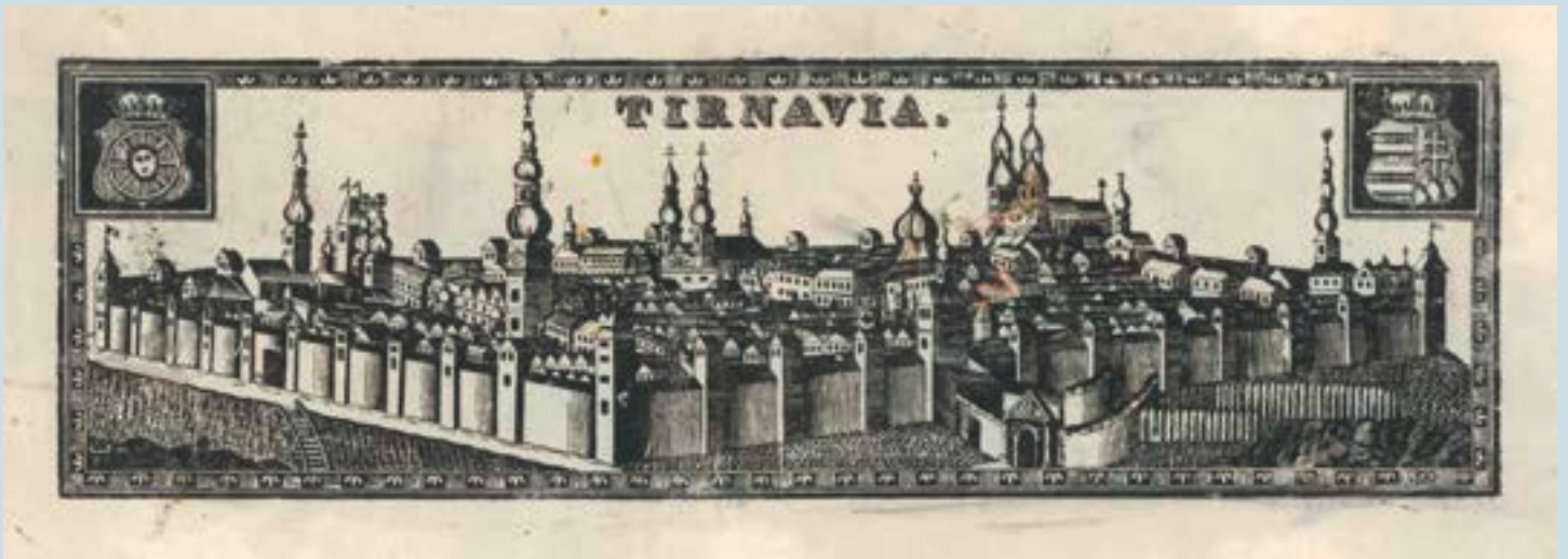
Slovak Engraver: View of Trnava, 1801–1850. Ernest Zmetak Art Gallery (SVK:GNZ.G_1387)

9:30 – 11:00 Guided tour of the historical centre with archeologist Erik Hrnčiarik